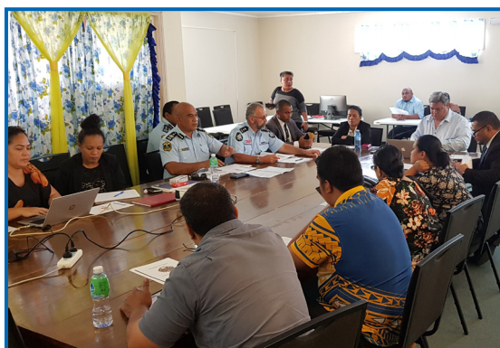
The Coronavirus Coordinating Committee meet regularly to update and formulate plans for the ongoing management and minimisation of the impact of coronavirus

This week, the Government successfully brokered an agreement with the Fiji Government to repatriate Nauruans from Fiji, beginning with those residing in the Western division of Nadi, Lautoka and Sigatoka as Suva residents wait out the city's two week lockdown.