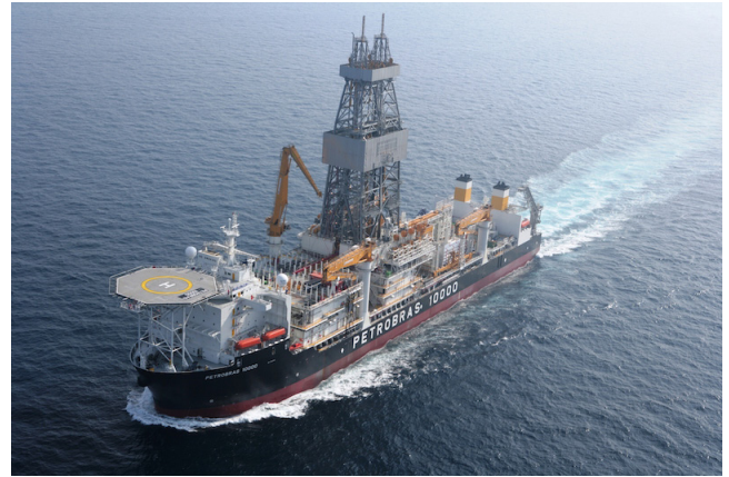
DeepGreen Metal partnered with Allseas to add another ship for deep-sea polymetallic nodule collection